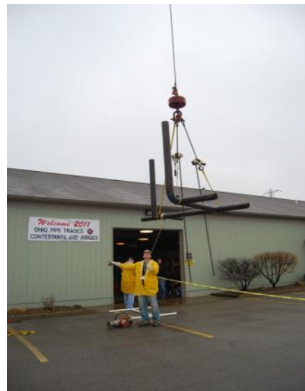
Right: Apprentices working on the crane portion outside of the hall at the 2011 State Apprentice Contest.