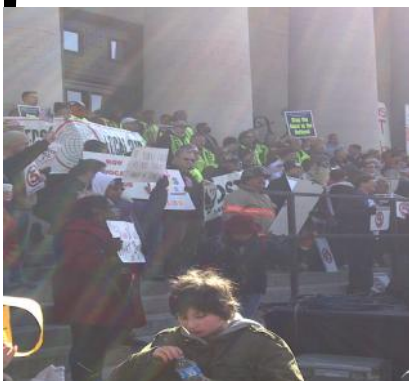
Left: SB5 Rally held in Columbus earlier this spring.