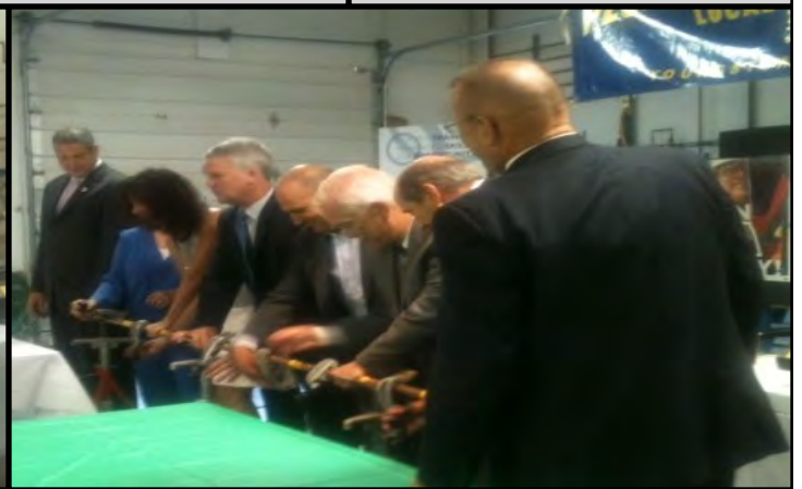
Ohio Appalachian Development Grant Award Pipe Cutting Ceremony