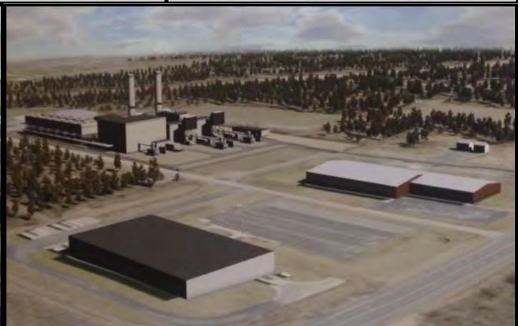
Future Combined Cycle Power Plant