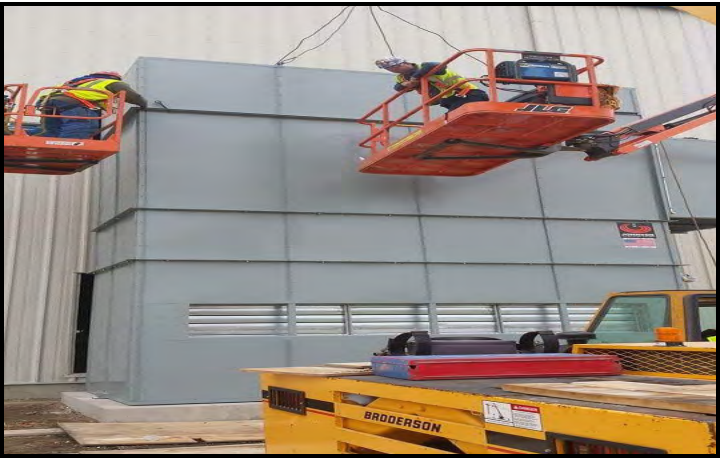
VAM Coupling Plant Great jobs by our members on the completion of this project Partnered with Vallourec Star