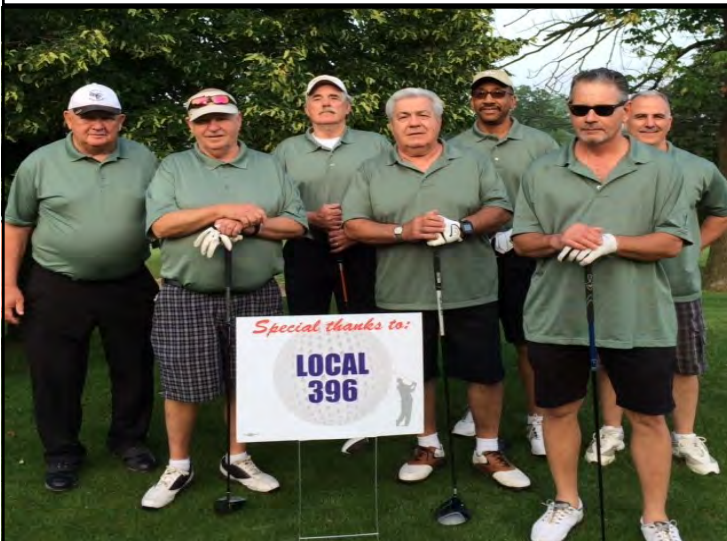
2015 State Golf Outing