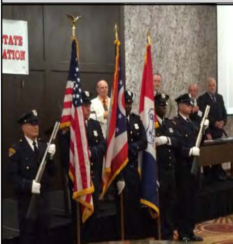
Opening Ceremony at the OSA 100th Convention in Cleveland, Ohio