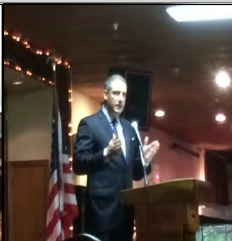
Tim Ryan Speaking at his Fundraising Event