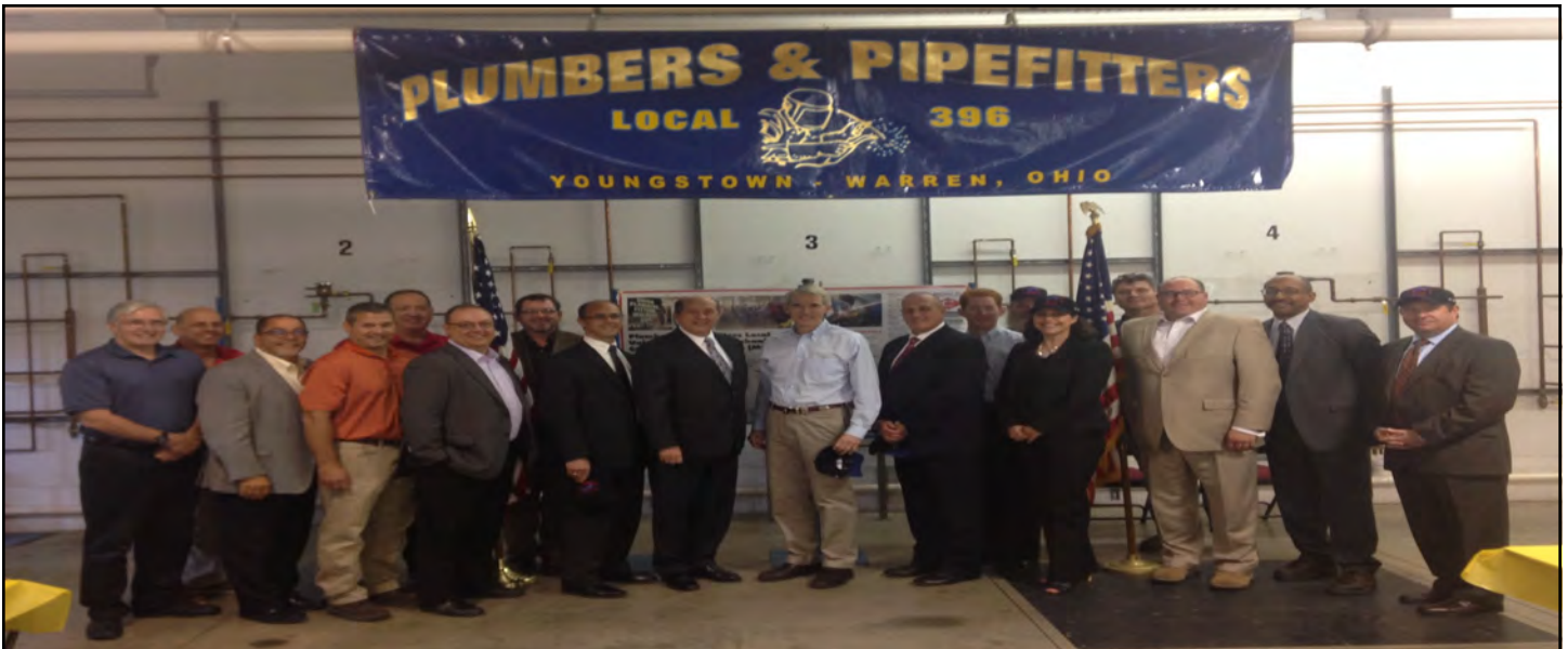
Local 396 hosted an event with Local 396 contractors, Ohio Oil and Gas Association, American Petroleum Institute and Government Officials