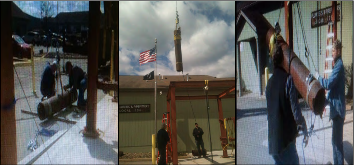
Rigging Classes has been a big success! Thanks to the instructors to get this moving in the right direction!