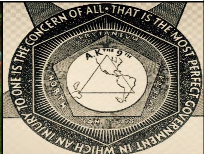
Knights of Labor Logo