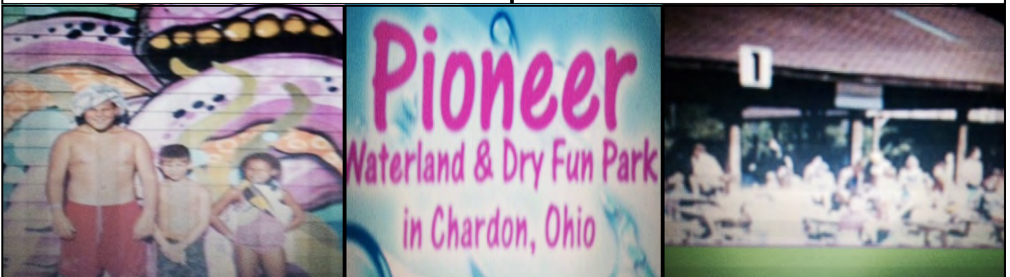
Local 396's Family Fun Day at Pioneer Water Park was a huge success and everybody enjoyed swimming and outdoor activities!

First Labor Day Celebration of an 8 Hour Workday was on September 5, 1894