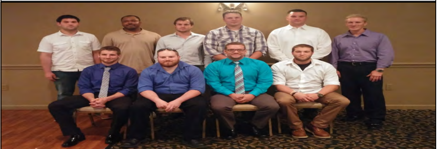
2015 Apprentice Graduating Class