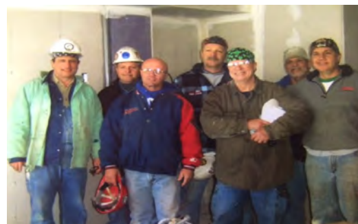
Picture from the past! Congratulations to the ones that are now enjoying retirement!

Remember to vote! The last day of registration is October 5, 2015. Absentee voting begins Tuesday, October 6, 2015. Election day is November 3, 2015. Let’s make a difference, every vote counts!